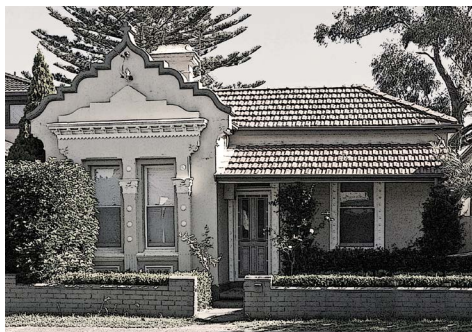
Eddy St Residence

A group of free standing, single storey late Victorian residences is a heritage feature of this short street. Originally built c.1890 to the same design, each has an Italianate façade and an unusual Dutch gable at the front. Despite changes to some of the houses, most of the design features have been preserved.