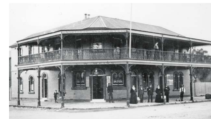
The Northern Star Hotel with balcony, early 1900s

Built in 1877, this is the earliest Hamilton hotel still in existence on the same site, and with the same name. A major redevelopment in 1969 saw much of the existing building, including the cast iron lacework balcony, demolished. In 2016, two generations of the Ramplin family celebrated 30 years as owner-operators of the hotel.