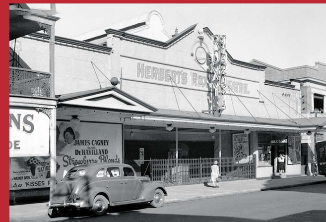
The Roxy Theatre, once at 99–101 Beaumont Street, began as a picture theatre around 1913. It was the home of the Newcastle Dramatic Art Club, from 1955–1971.

Facebook: https://www.facebook.com/HamiltonNow