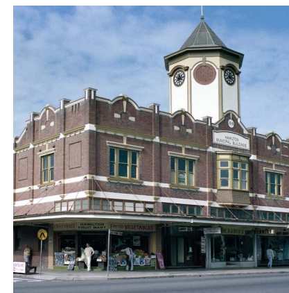
The third Hamilton Municipal building, before the 1989 earthquake

This is the third Hamilton Chambers building. Hamilton Municipal Council was incorporated in 1872 and the first Council Chambers was built in 1880. A second building in 1892 was soon replaced by a third in 1919. The distinctive W R Alexander clock tower was added in 1929. On 31 March, 1938 an independent Hamilton Council met for the last time. Damaged in the 1989 earthquake, the clock tower was reinstated using clock faces and mechanisms from the original structure. The building was substantially rebuilt and the James Street plaza created at this time.