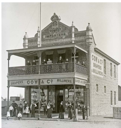
Gow and Co. Store, corner of Beaumont and Cleary streets, Hamilton, 1898