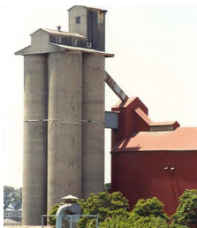
Hamilton mill silos, 1982

C Old Hamilton flour mill the towering silos were a prominent Hamilton landmark until demolished in 1990 after the earthquake P H