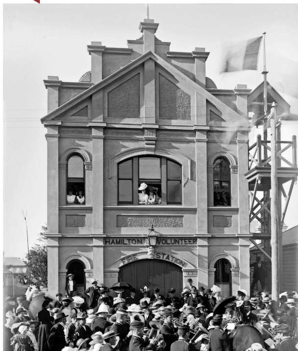
Celebrating the addition of a second storey to the Hamilton Fire Station, 1906

Discover how a 19th century settlement of immigrant coal miners transformed into the vibrant multicultural suburb of Hamilton.