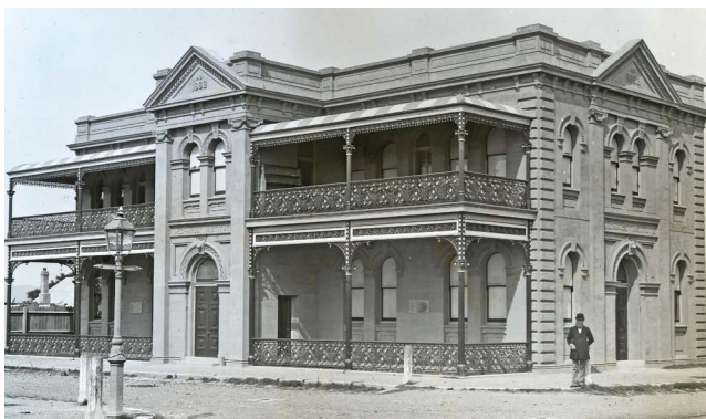
Mechanics Institute, Hamilton, 1892