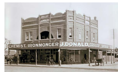
Donald's Chemist, Grocer and Ironmonger, c.1900