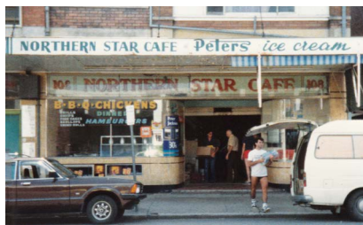
Northern Star Café, mid 1980s

When this café opened in the early 1940s, it offered a typical Australian menu of the times. It was especially popular with men working on Newcastle's industrial sites, and later, students. In the 1980s the Italian owners began responding to customers' interest in homestyle Italian food, which quickly became the signature of this enduring Hamilton café.