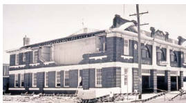
Earthquake damage, Newcastle Ambulance Station, 1989

I Ambulance Station built in 1923 and still a fully operational ambulance station of NSW Ambulance P H